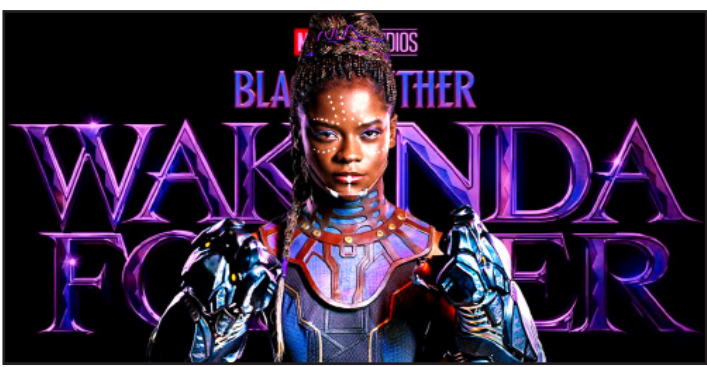
Black Panther: Wakanda Forever 2022