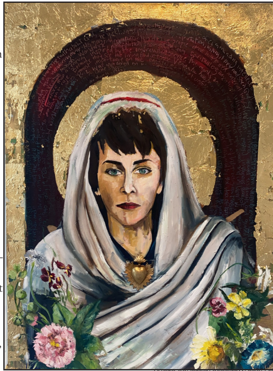
Artwork from the "Souls Shot Portrait Project" Exhibition