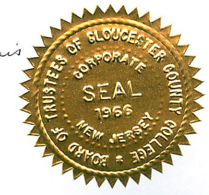
Chairman of the Board